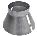
FLOW CONTROL WEIR