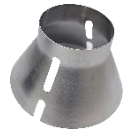
FLOW CONTROL WEIR